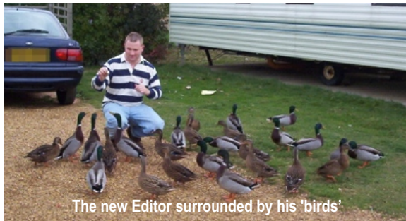
The new Editor surrounded by his 'birds'

Now a little about me: I am 34, work for British Airways and am engaged to a Dutch girl. I grew up in Cornwall, moving to London and becoming a member of 18 Plus in the early 90s. After a spell with Bromley I joined Hounslow (then Acton) in 1997. I stood as Secretary at the next Bi-