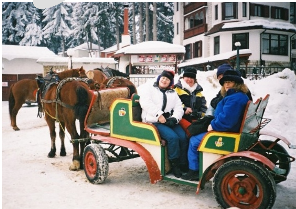
National Skiing Holiday Bulgaria

National Skiing Holiday / Annual National Conference / WASH / Your New Plus News Editor